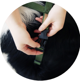
Sizes and fittings

The artisanal manufacturing pays great attention to every detail. All the parts are assembled with safety stitching. The folds that are in contact with the skin are finished with a special stitching designed to avoid scratches and rubbing, even in dogs with short or clipped hair.