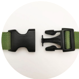
Buckles and loops

All metal components are made specifically on our design and are produced in AISI-304 stainless steel that does not release Nickel, hence it is hypoallergenic in accordance with the relevant European directives.